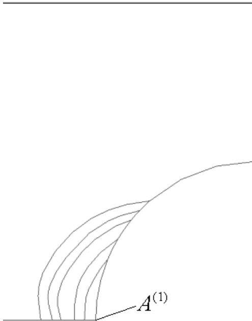
Fig. 1. The layers V^{(i)(j)} in a strip with a hole.

Now we demonstrate some results of the strength analysis of the tests [7]. Owing to their symmetry it is reasonable to consider a quarter of each strip. Fig. 1 concerns a strip 25.4 mm long with a central hole 12.7 mm diameter and shows location and configuration of the layers V^{(i)(j)} composing the only domain V^{(1)} wherein a significant strain concentration takes place; at that j = 1, \dots, N^{(1)} , N^{(1)} = 5 , p_c^{(1)(1)} = 1.15 , after intermediate value p_c^{(1)(2)} the differences (p_c^{(1)(j+1)} - p_c^{(1)(j)}) are accepted the same for all j = 2, \dots, N^{(1)} - 1 , and in the end p_c^{(1)(N^{(1)})} = p_c(A^{(1)}) = 1.5 . Fig. 2 is the same for a strip with a central cut if the cut tip is modelled by the rounding with radius r = 0.25 mm (this value of r is the upper bound estimate of the size of filler particles in the considered material); at that N^{(1)} = 10 , p_c^{(1)(1)} = 1.4 , p_c(A^{(1)}) = 10.0 . The strength analysis for the cases r = 0.5, 1 [mm] was done also (see [6]).