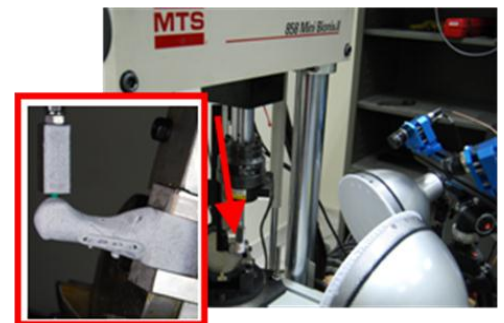
Fig.2 Experimental set-up