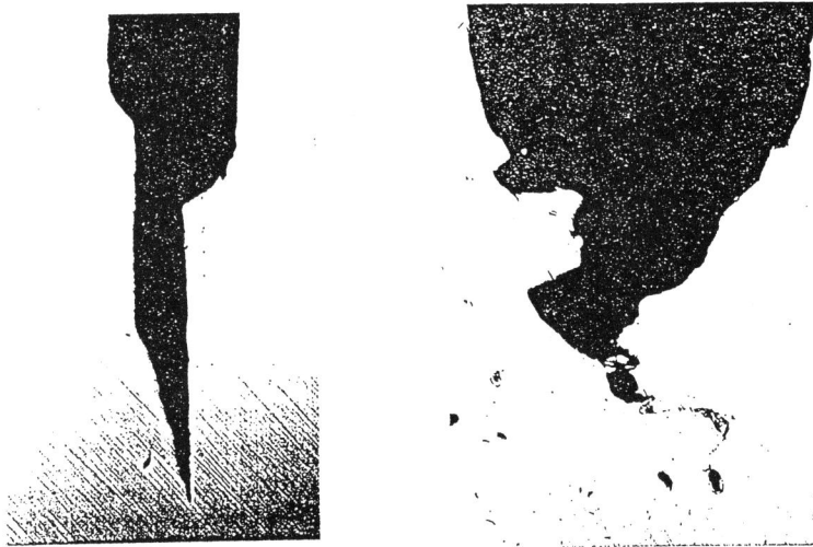
Fig 6 Crack tip profiles for a) Mode II b) Mode I