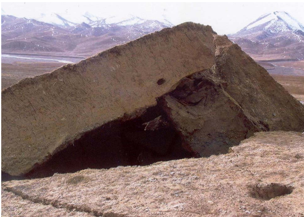
Figure 3. A tent-shaped mole track typical of the frozen soil layer with a height of 2 m, north of Wuxue Peak (after photograph 18 of [17])

The Kunlun Mountain is part of the Qinghai-Tibet Plateau, a region of the largest-scale tectonic uplift. The ground elevations along the seismic surface rupture zone were about 4600 m to 5000 m above the sea level. The grounds that were ruptured by the seismic fault movement were dominantly permafrost grounds. Ice layers covered on the rivers were also ruptured. Album showing the seismic surface ruptures and destruction was published by China Seismological Bureau [17]. It contains 140 colored photographs showing the seismic rupture zone from the west to the east. Two photographs 18 and 58 from the Album [17] are represented in Figures 3 and 4, respectively. Their locations are identified in Figure 2.