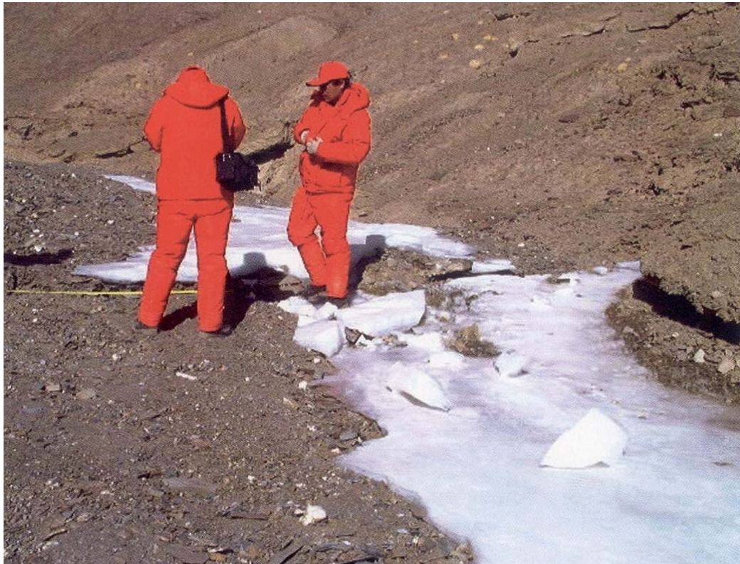
Figure 4. The ice in a gully was displaced 1.4 m in left-lateral sense 25 km east of Kusai Lake (after photograph 58 of [17])

From the site photograph 58 in Figure 4, it can be evidently observed that the frozen soil layer and the ice cover in a gully were largely uplifted, bended and then dislocated in tension and shear. The broken ice plates had fresh, sharp and angular sides and edges. There were no signs of melting, thawing, plastic flow, muds, and/or refreezing in the gully ice plates and frozen soils. In other words, the seriously broken frozen soils and ice plates maintained their frozen states during and a few days after the ground rupture and shock.